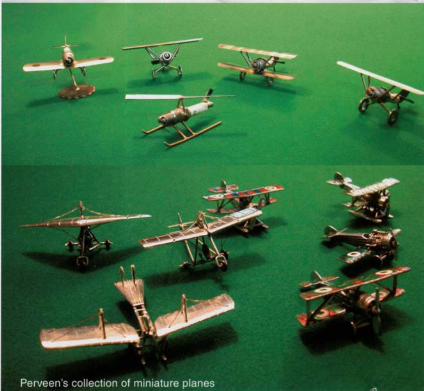
Perveen's collection of miniature planes